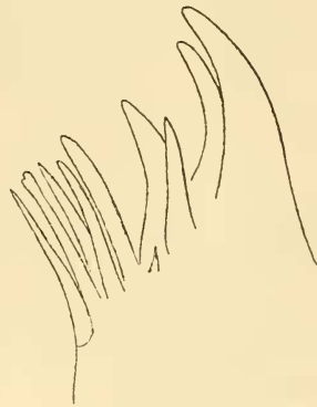
Fig. 2. Eub. instrenuum 100 / 1 .